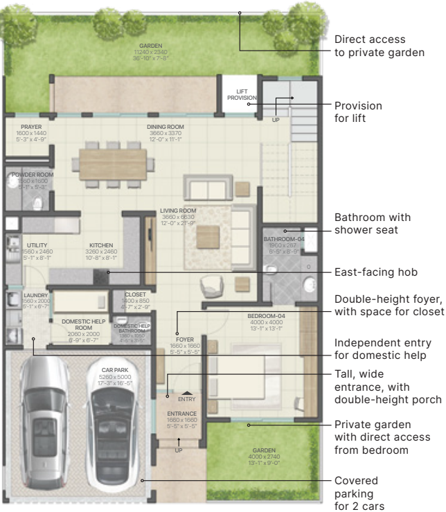
Ground Floor Front Yard, Bedroom, Bathroom, Living Room, Dining Area, Kitchen, Powder Room, Backyard, DH Room with Bathroom

Type A4 SBA: 3459 SFT Carpet Area: 2630 SFT