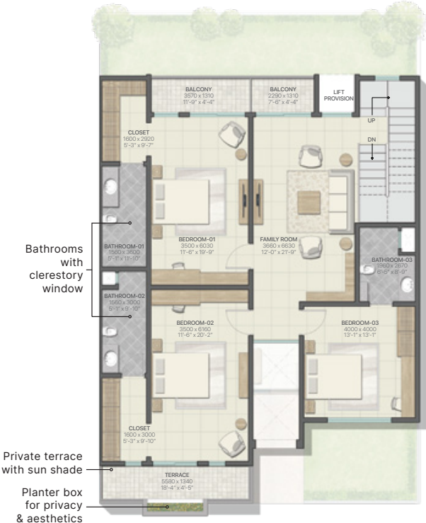
First Floor 1 Family Room, 3 Bedrooms, 3 Bathrooms, 2 Balconies, 1 Terrace